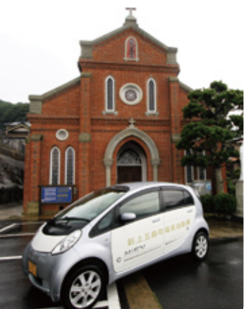
An i-MiEV in front of Aosagaura Church