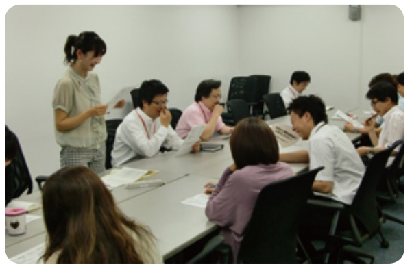
A meeting in progress