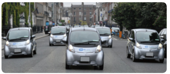
i-MiEVs cruise through Dublin

The Irish government already supports the use of electric vehicles in various ways, notably by providing a EUR 5,000 subsidy per unit and exempting electric vehicle owners from its automobile registration tax. The government has announced that it will install chargers at 3,500 sites and set up 30 quick-charge stations around the country by the end of 2011.