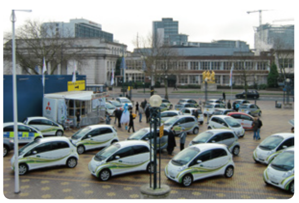
25 i-MiEVs gathered in Birminghan

December 12, 2009 saw 25 i-MiEV cars gather in Century Square, Birmingham, the United Kingdom's secondlargest city. MMC supplied these vehicles for an ultralow CO<sub>2</sub> car-testing program of the U.K. Technology Strategy Board. With the aim of fostering environmentally friendly cities by making electric vehicles popular, after the program we proved the utility of i-MiEV s as police and other public service vehicles and provided the populace with opportunities to use these vehicles on a daily basis.