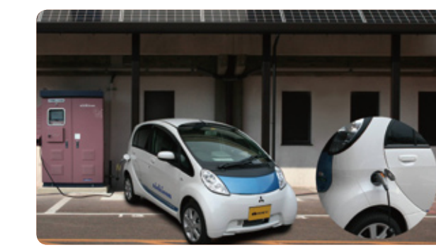
Charging with clean solar powe

MMC electric vehicle website http://global.ev-life.com/