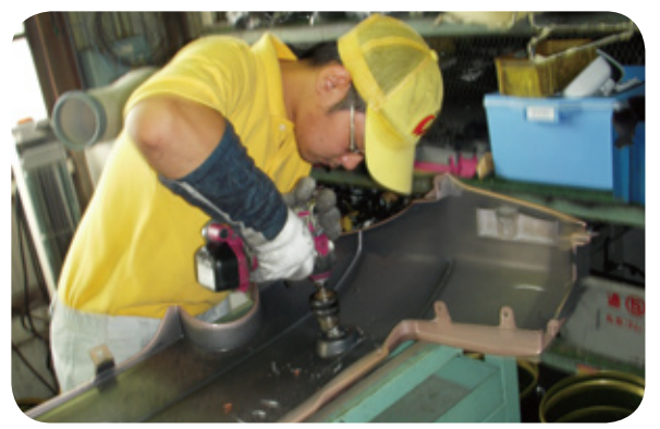
MMC Wing employee disassembling a defective part