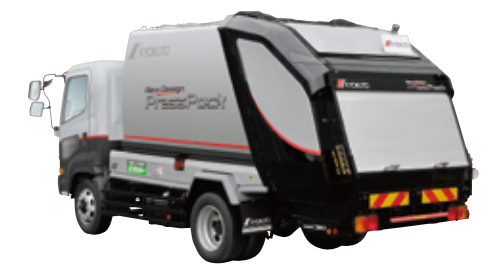
ePacker electric garbage truck by Kyokuto Kaihatsu Kogyo